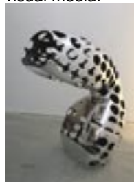
Ron Arad August 2-October 19, 2009

The Museum of Modern Art is dedicated to being the foremost museum of modern art in the world. A collection which is more than an assemblage of masterworks, Moma provides a uniquely comprehensive survey of the unfolding modern movement in all visual media.